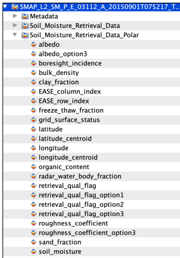
Figure 1. Subset of File Contents. For a complete list of file contents for the SMAP enhanced Level-2 soil moisture product, refer to the Appendix.