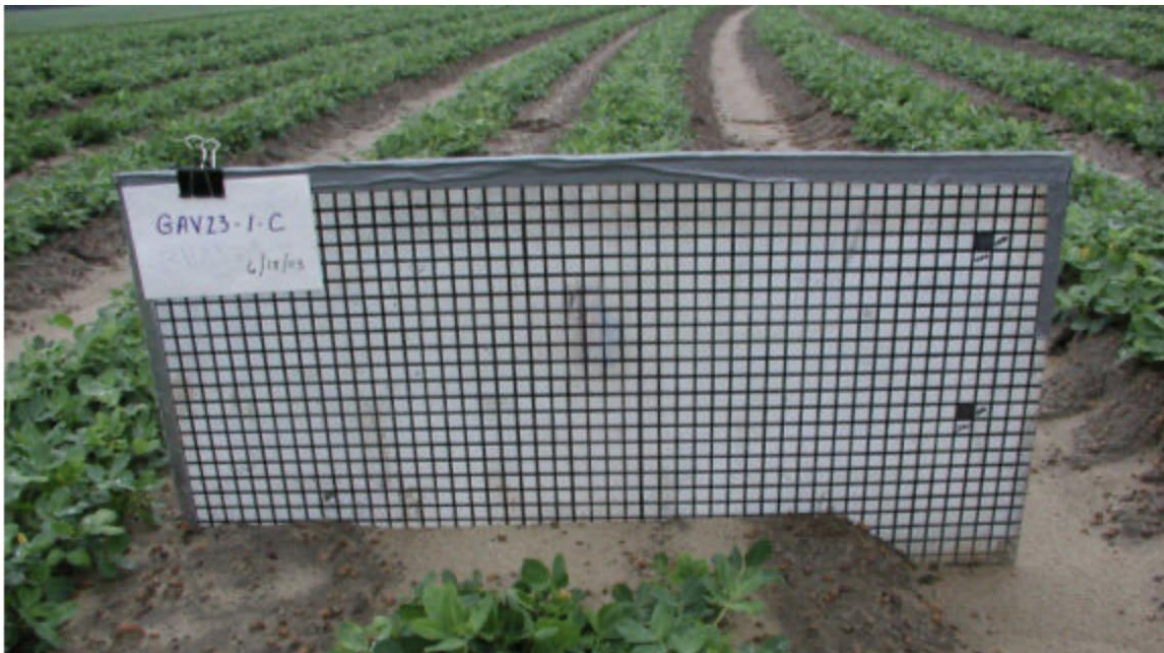
Figure 2 A grid board used for surface roughness measurements during the SMEX03 campaign.