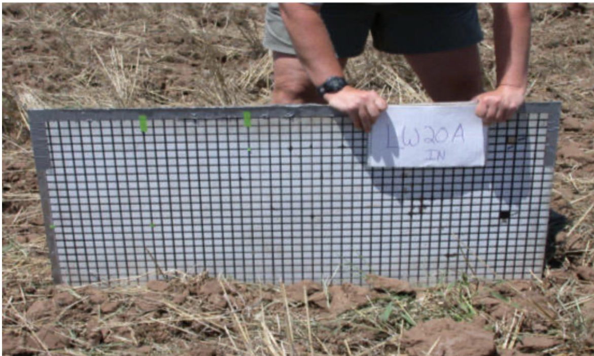
Figure 3 A grid board used for surface roughness measurements during the SMEX03 campaign.