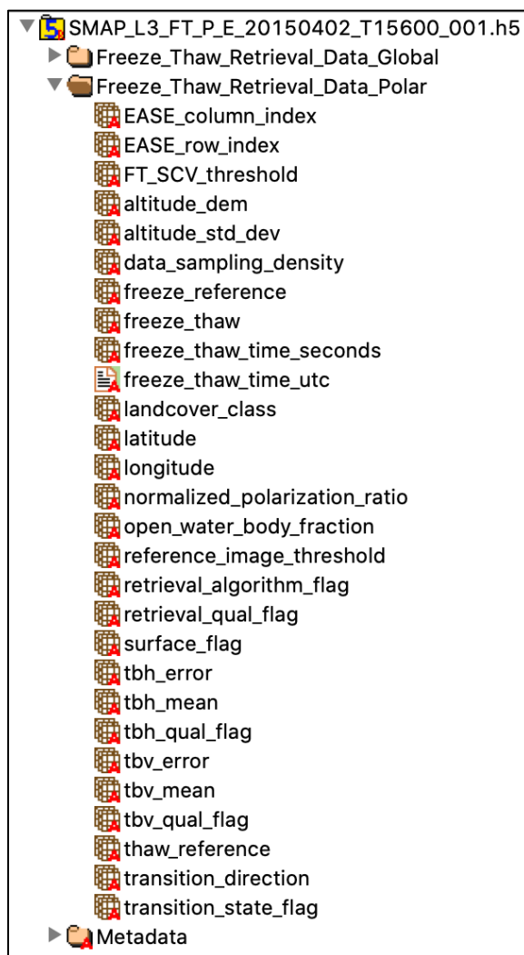
Figure 1. Subset of File Contents. For a complete list of file contents for the SMAP enhanced Level-3 radiometer freeze/thaw product, refer to the Appendix.