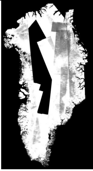
Figure 6. Sample ex.tif file for the dates 01 November 2019 to 30 November 2019.