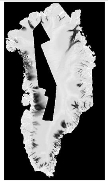
Figure 4. Sample vv.tif file for the dates 01 November 2019 to 30 November 2019; gray scale version of color log scale velocity saturation at 3000m/year