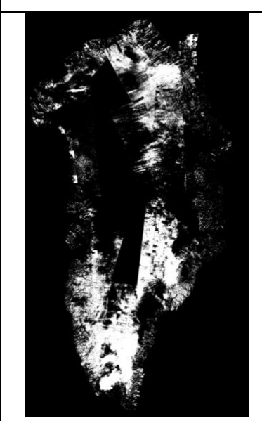
Figure 5. Sample dT.tif for the dates 01 November 2019 to 30 November 2019.