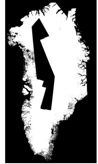
Figure 7. Sample ey.tif file for the dates 01 November 2019 to 30 November 2019.

Velocities are reported in meters per year. The vx and vy files contain component velocities in the x- and y-directions defined by the polar stereographic grid. These velocities are true values and not subject to the distance distortions present in a polar stereographic grid. Small holes have been filled via interpolation in some areas. Interpolated values are identifiable as locations that have velocity data but no error estimates. Radar-derived velocities are determined using a combination