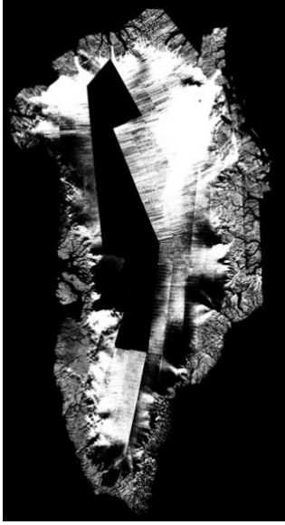
Figure 3. Sample vy.tif file for the dates 01 November 2019 to 30 November 2019.