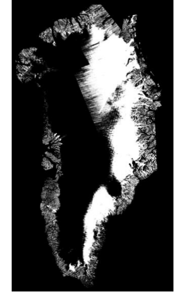
Figure 2. Sample vx.tif file for the dates 01 November 2019 to 30 November 2019.