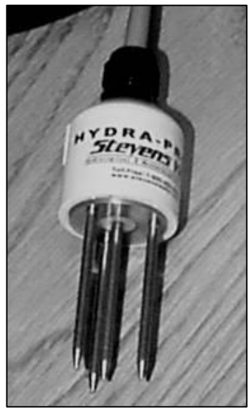
Figure 2. Vitel Hydra Probe