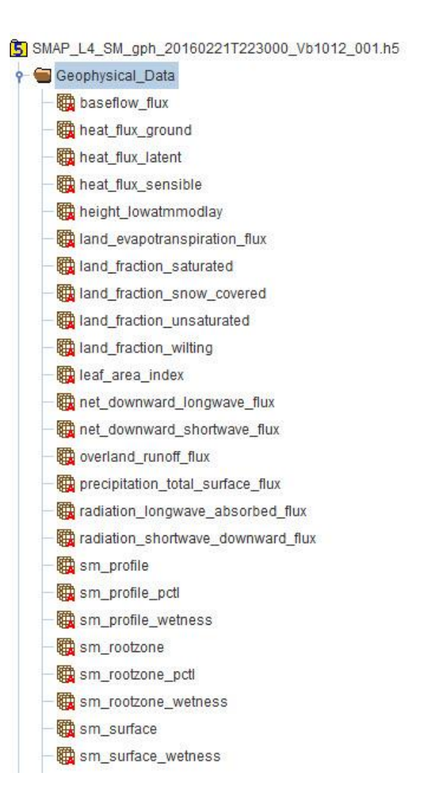
Figure 1. Subset of the Geophysical Data File Contents. For a complete list of file contents for the SMAP Level-4 soil moisture product, refer to the Product Specification Document.