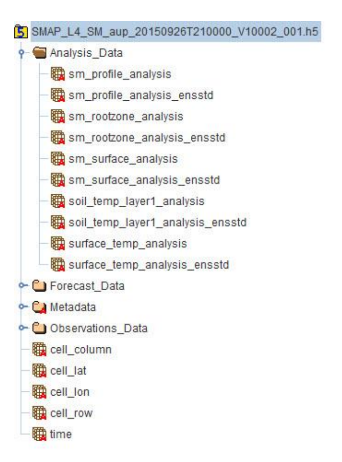
Figure 2. Subset of the Analysis Update Data File Contents. For a complete list of file contents for the SMAP Level-4 soil moisture product, refer to the Product Specification Document.