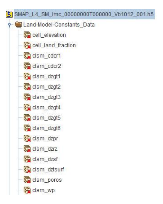
Figure 3. Subset of the Land Model Constants File Contents. For a complete list of file contents for the SMAP Level-4 soil moisture product, refer to the Product Specification Document.