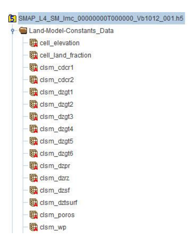
Figure 3. Subset of the Land Model Constants File Contents. For a complete list of file contents for the SMAP Level-4 soil moisture product, refer to the Product Specification Document.

The Land Model Constants (Imc) product includes static land surface model constants that provide further interpretation of the geophysical land surface fields. Figure 3 shows a subset of the Imc file contents.