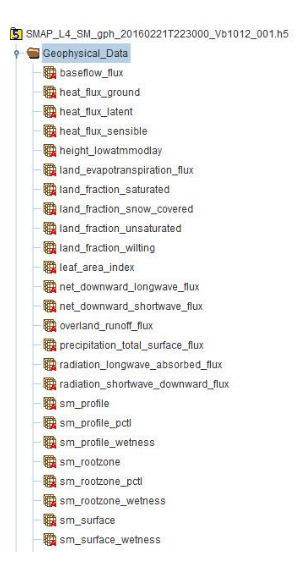
Figure 1. Subset of the Geophysical Data File Contents. For a complete list of file contents for the SMAP Level-4 soil moisture product, refer to the Product Specification Document.

The Geophysical Data (gph) product includes a series of 3-hourly time-averaged geophysical data fields from the assimilation system, such as surface and root zone soil moisture. Figure 1 shows a subset of the gph file contents.