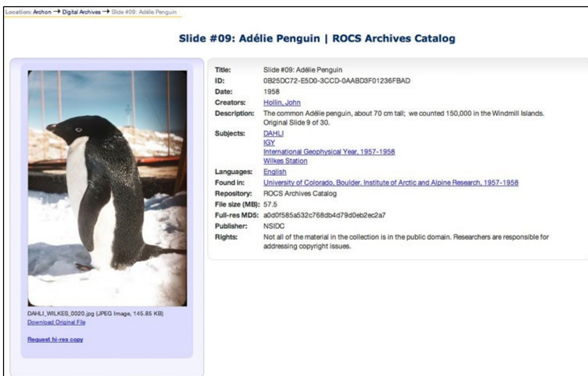
Figure 1. Sample Image Record from the ARC Archives Catalog

Figure 1 shows a record that was found by searching Archon for "Adelie" in the search box on the catalog interface, and then clicking on Digital Images and Records and then Search image thumbnails.