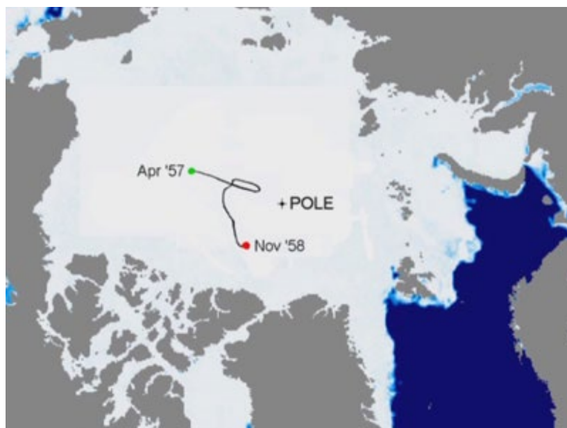
Figure 2. Path of Drifting Station Alpha

The green dot marks the spot where the station was established in April 1957, and the red dot marks the end of the project in November 1958. The station drifted over 3000 km during an 18-month time period.