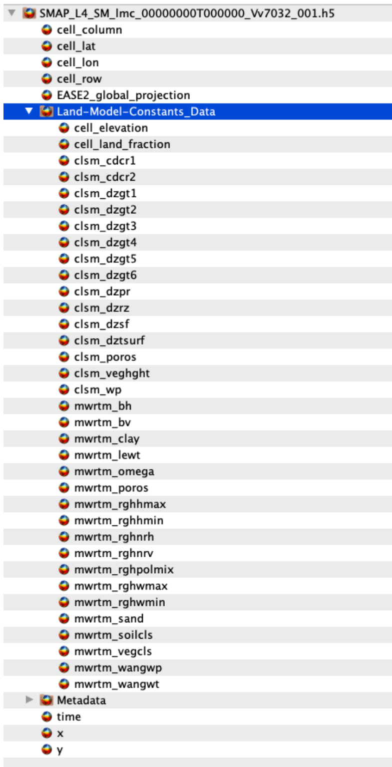
Figure 3. Contents of a Land Model Constants file. For a complete list of file contents for the SMAP Level-4 soil moisture product refer to the L4_SM Product Specification Document (Reichle et al., 2022a) available in the Documentation section of the landing page. Data Fields