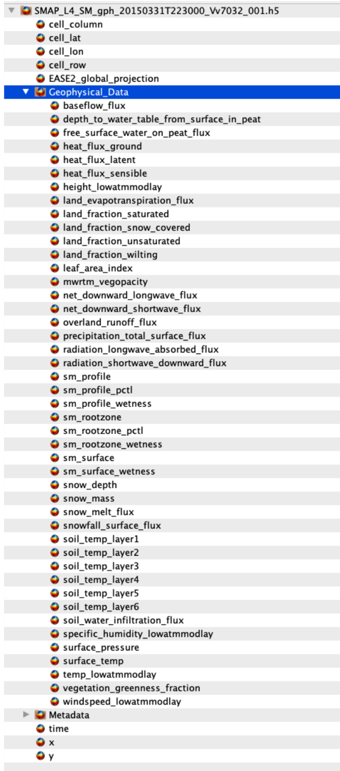
Figure 1. Contents of a Geophysical Data file. For a complete list of file contents for the SMAP Level-4 soil moisture product, refer to the L4_SM Product Specification Document (Reichle et al., 2022a) available in the Documentation section of the landing page.