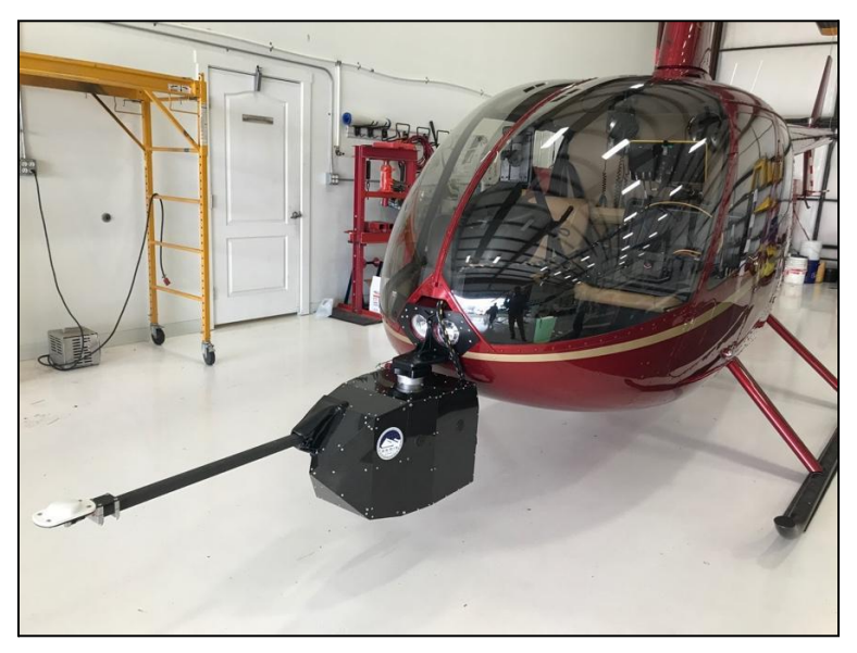
Figure 2 - CRREL's nose-mounted Meeker System installed on a Robinson R66 helicopter. All sensors are located inside the pod, with control systems located within the passenger compartment for in-flight operations.