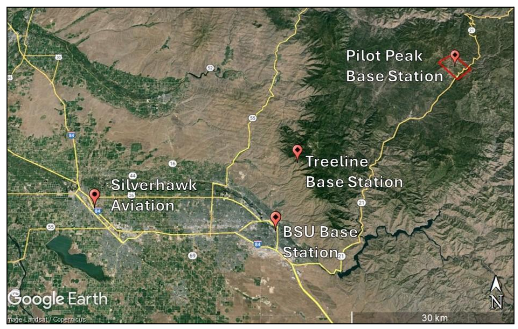
Figure 3 - A map of base stations used throughout the collection period. The red polygon in the northwest corner denotes the target survey area.