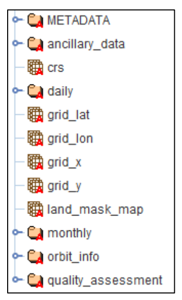
Figure 1. ATL20 Top-Level Data Groups and Variables

Within data files, similar variables such as science data, instrument parameters, and metadata are grouped together according to the HDF model. The following figure shows data groups and variables stored at the top level in ATL20 data files: