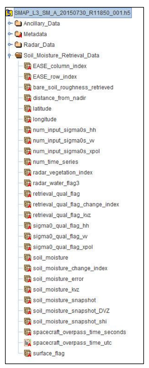
Figure 1. Subset of File Contents. For a complete list of file contents for the SMAP Level-3 radar soil moisture product, refer to the Appendix.