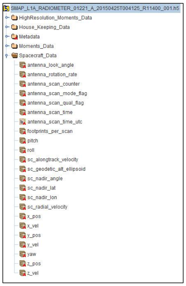
Figure 1. Subset of File Contents. For a complete list of file contents for the SMAP Level-1A telemetry product, refer to the Appendix.

The five main groups are summarized below. For a complete list and description of all data fields within these groups, refer to the Appendix of this document. Note that data array dimensions and sizes vary for this product.