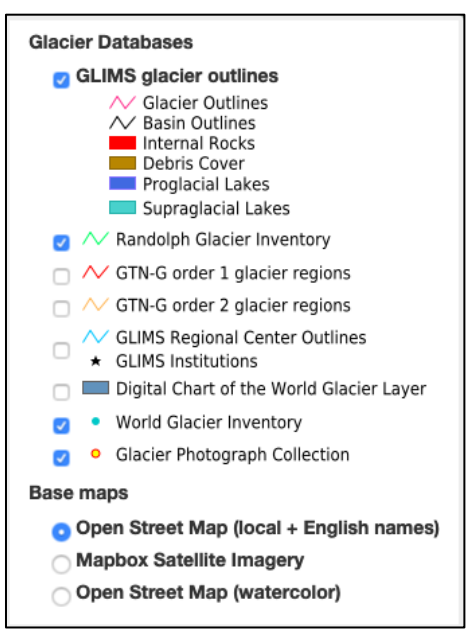
Figure 3. GLIMS Glacier Viewer Legend