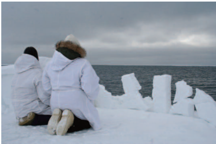
Inuit forecasters equipped with generations of environmental knowledge are helping scientists understand changes in Arctic weather.