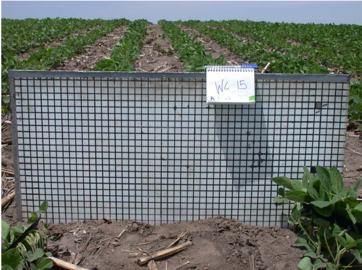
An example of a roughness picture taken in the Walnut Creek Experimental Watershed during SMEX05