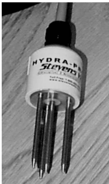
Figure 1: Hydra Probe by Stevens Water Inc.

Soil moisture and temperature for the surface layer were measured using Vitel Type A Hydra Probes (HP). This version is compatible with Campbell CR-10 data loggers; the temperature output voltage never exceeds 2.5 V.