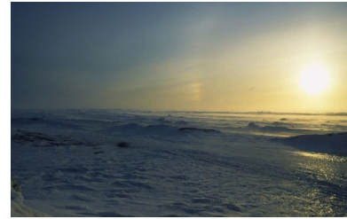
Figure 11 from tour: Photograph of the Chukchi Sea.